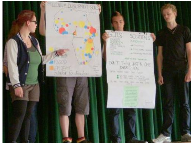
Presenting the group work at the Alexander-Puschkin Gymnasium, Hennigsdorf

The ideas for solutions are intended to encourage new projects in Germany with the aim of raising awareness for globalisation, the Millennium Development Goals and developmental key problems.