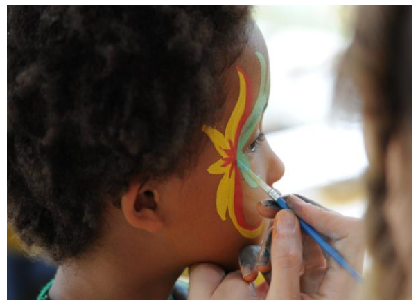
Face painting for the little ones during events in the Kids corner

Numerous popular musicians added to the event with wonderful music and supported the project by performing without pay. Although it started raining in the afternoon the atmosphere continued to be great and the guests celebrated and danced until late in the night, a lot of them barefooted.