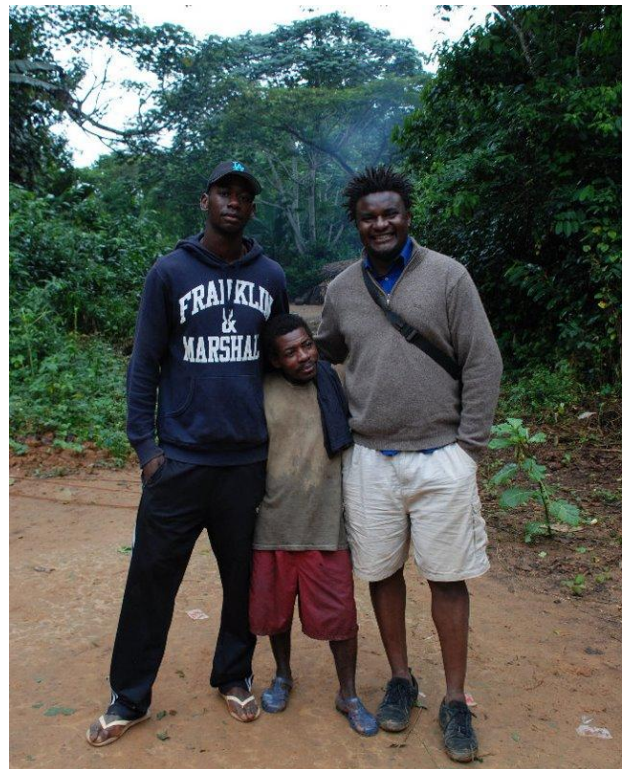
The difference in size is extreme...but our volunteers are also taller than usual

After eating lunch together we handed over our presents. Then we sat together one more time with the Eldest to discuss the challenges which the Baka are facing and how they could be solved.