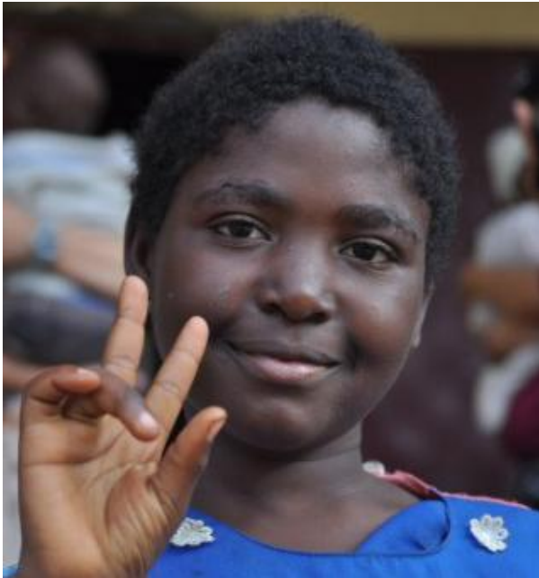
Friendly Greetings in the Orphanage in Bali

In August 2011 a team of the Hope Foundation visited the Bosa-Orphanage in Bali Nyonga, where approx. 45 children live. Bali Nyonga is a village in the north-west of Cameroon. The society is well connected, communities are well organised and families live together. Despite of that there are many orphans in this area and the majority lives in the Bosa-Orphanage.