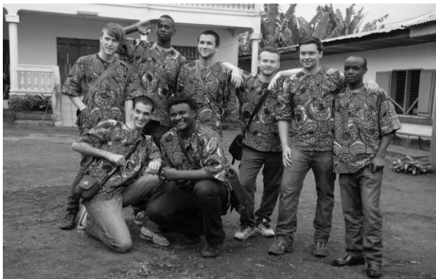
Group picture with traditional clothing, it is a cultural exchange and not merely a volunteer service.

In the project “Bridging Cultures” we were supported by interns from Brazil, Nigeria, Ghana and Taiwan.