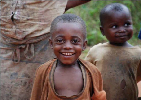
There is hope behind this smile, Baka Pygmies

In the End of August a team of the Hope Foundation visited the Baka-Pygmyes in the East of Cameroon. To get to them we had to travel almost 600 km into the heart of the equatorial rain forest. There we reached our goal, a small Baka-Pygmyes-Settlement, where we spent the night.