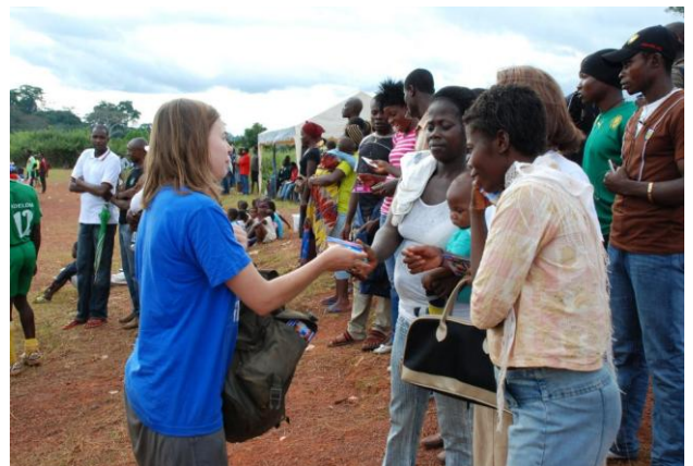
A volunteer distributes condoms and informs about sexually transmissible diseases

The Football 4 Life Project takes place annually in the rural regions of Cameroon. The goal of the project is to reach the adolescents through the positive context of a joint sports event and to inform them about infectious diseases like HIV/AIDS and Malaria as well as about the dangers of drug abuse. The tournaments lasts for four weeks and takes place in peripheral cities, like this year in Bali Nyonga and Lomié. Before each game there was a speech addressing prevention and during the games volunteers of the Hope Foundation talked to the audience about the above mentioned topics and distributed condoms.