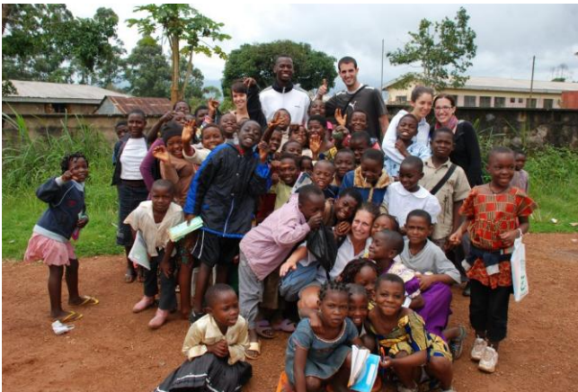
Group photo with pupils of the Summer School in Bali Nyonga

I was responsible for the maths class, together with two French interns. There were At each of the four classes at the public school in Bali Nyonga we taught one hour of maths. We usually started the lesson with counting games. After an introductory game we started with the main part which dealt with multiplication, geometry or text based problems.