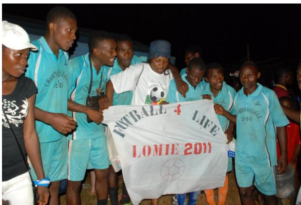
The winning team at the Football 4 Life tournament in Lomié

But not only the lack of information and education poses a challenge.