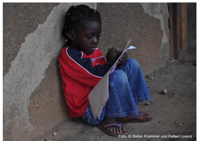
Abb.: Fleißige Schülerin in der Pause der Sommerschul in Bali Nyonga

The school project was a true blessing for the parents as it is harvesting time in August and there are barely no possibilities to keep the children busy in a sensible way.