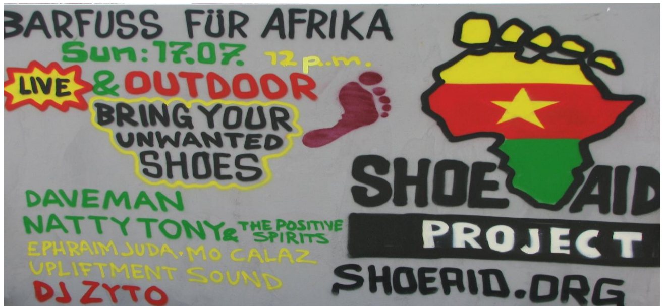
Announcement board at the YAAM for Barefoot for Africa Event

Second "Barefoot for Africa" event was despite of rain a great success, July 2011