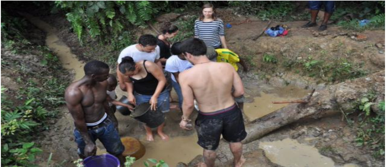
Repairing a drinking water point in Lomié East-Cameroon

Last summer several volunteers of the Hope Foundation went to Lomié, to work in different projects. There they met a fundamental problem which doesn't only makes the life of the local people difficult but even endangers it: The insufficient supply of potable water. Being forced to use polluted water is the main cause for the spreading of a number of diseases. Many villagers have to walk for many kilometres to reach clean water. And that, despite of the fact, that theoretically there are sufficient drinking water points to supply the people – or at least make the supply much more easier.