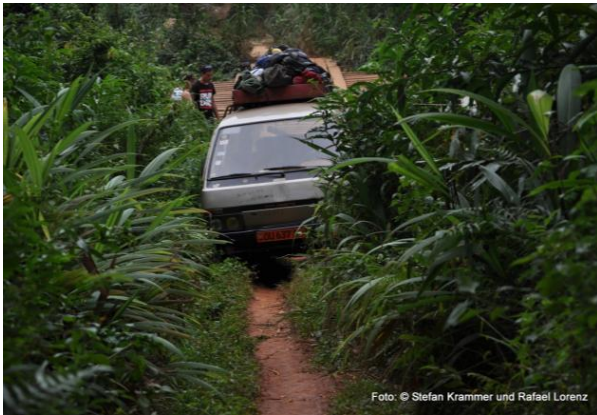
Abb.: Straße zum Pygmäen Dorf in Ost-Kamerun

Instead of working in an office or a production site, we flew 7000 km to Cameroon to implement different developmental aid projects.