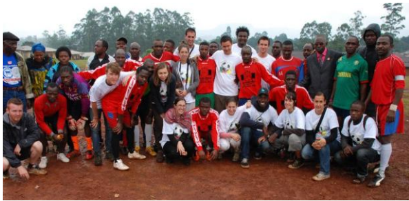
Team photo with the international volunteers

The health care in Cameroon is deficient. A huge problem in the country is the high HIV infection rate. According to UNICEF approx. five percent of the adults in the age between 15 and 49 years are infected. Only 30% of the youth have extensive knowledge about this disease.